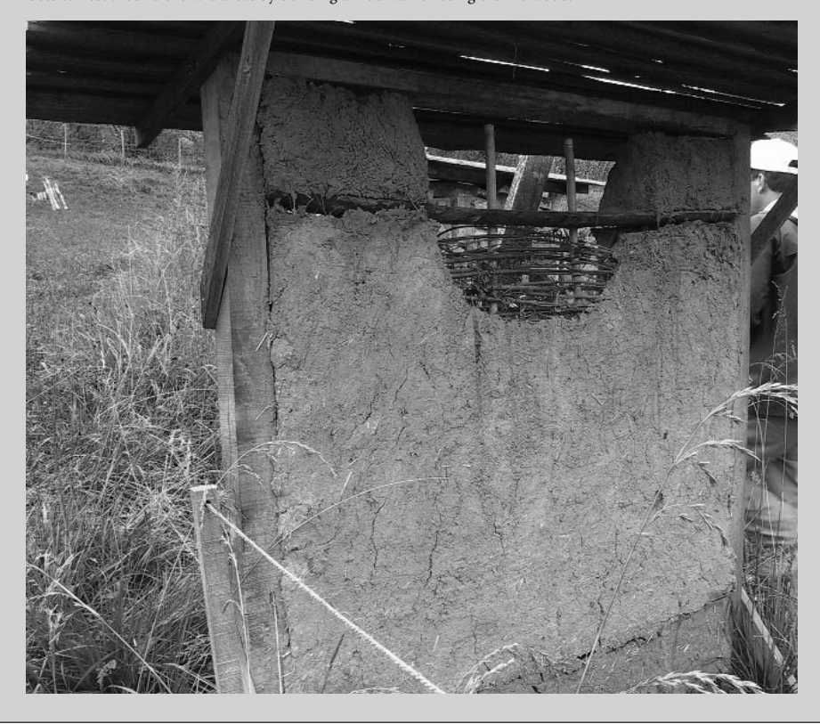
At FIBL, the Research Institute for Organic Farming in Frick, Switzerland, we saw another way to encourage wild bees to nest around orchard areas by building a mud wall or using old fire wood.

recommended practice is not followed. A minimum score must be attained for a grower to be certified. Different types of point systems are used depending on the organization. Some IFP programs or certifiers do not use a point system.